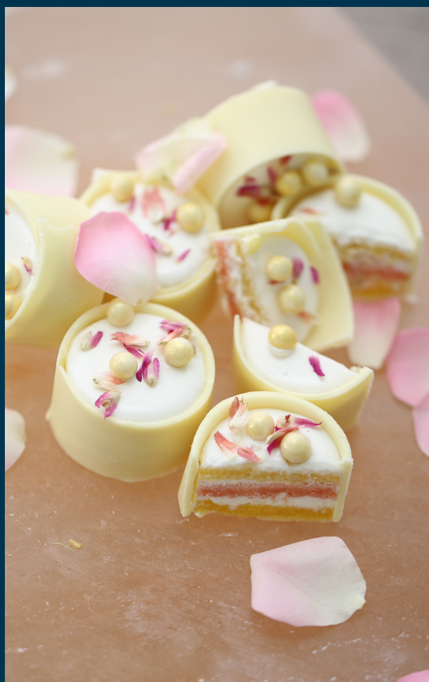
Dish Catering and Events